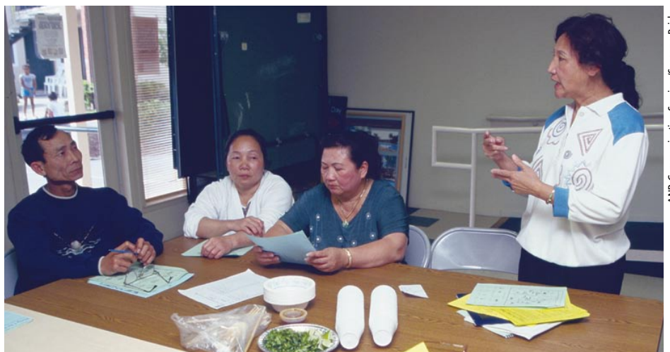
EFNEP provides 4 to 6 weeks of classes in a small-group setting to more than 13,000 low-income California families each year. The program is administered by UC nutrition scientists and educators.

The EFNEP program (in both Virginia and in California) teaches low-income families how to purchase, safely prepare and serve a balanced, highly nutritious diet. The program emphasizes the increased consumption of fruits and vegetables, decreased consumption of fat, and improved skills in food safety, preparation and shopping, with the long-range goal of improved health and risk reduction for chronic diseases. The 1990 Dietary Guidelines for Americans were the basis for instruction during the time of this study (USDA/DHHS 1995), although the recently updated version is currently used. Participants receive intensive nutrition education from